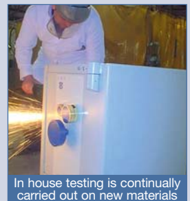
In house testing is continually carried out on new materials