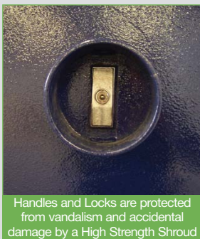
Handles and Locks are protected from vandalism and accidental damage by a High Strength Shroud