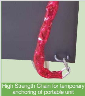
High Strength Chain for temporary anchoring of portable unit

Dimensions in brackets in inches all other dimensions in mm