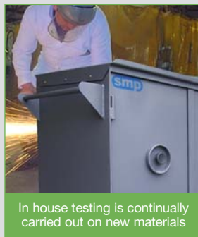
In house testing is continually carried out on new materials